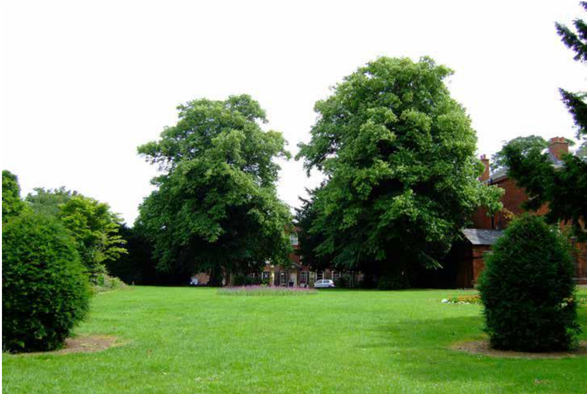
Belgrave Gardens, with Belgrave Hall in the background

In all cases the responsibility for the tree stock reverts to the relevant land holding service once any maintenance or management work that the trees and woodlands section is able to commission (given resource constraints) is completed.