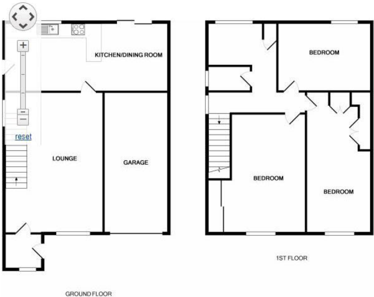
Master Floorplan Image